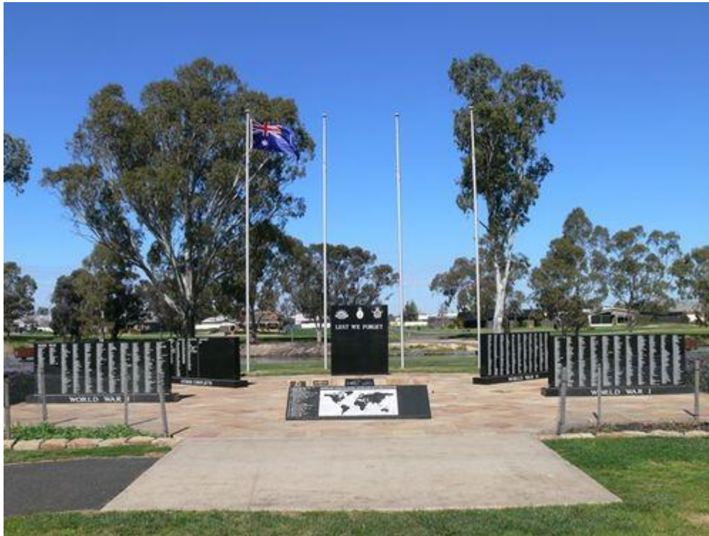
Horsham & District War Memorial