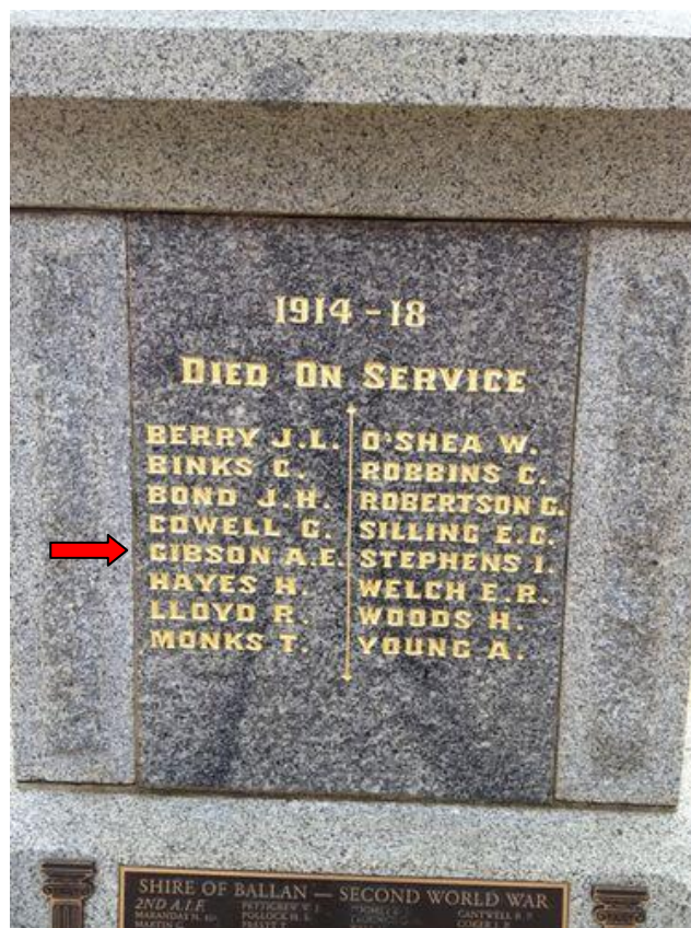
Ballan War Memorial